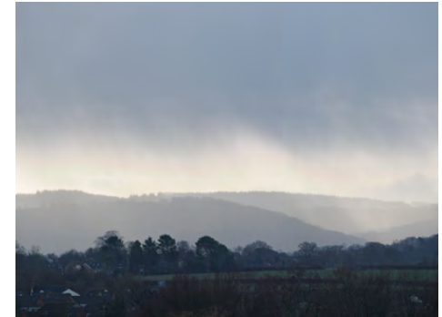
Rain falling on the Blackdown Hills