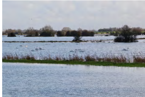
Curry Moor on the Somerset Levels, seen from just below Burrow Mump at Burrowbridge