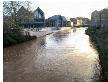
Water high on the River Tone in Taunton by the new riverside development, near the Brewhouse theatre