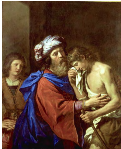
Return of the prodigal son by Guercino (1591-1666), Diocesan Museum in Włocławek