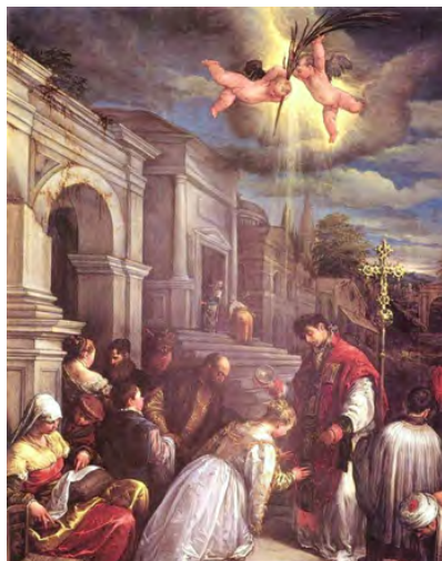
St Valentine baptises St Lucilla by Jacopo dal Ponte called Bassano (ca. 1510-1592)