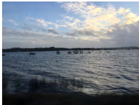
Flooding on the Somerset Levels viewed from a train