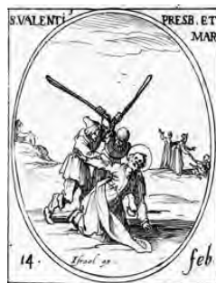
Martyrdom of St Valentine. Print of etching by Jacques Callot in the National Gallery of Art in Washington

Valentine's Day is celebrated on the 14th February. Valentine was a common name during Late Antiquity, and as far as it is known St Valentine of Valentine's Day was one of two men preaching the good news in Rome in the 3rd century. One of them was martyred on February 14th, 269. It was declared a Christian feast day by Pope Gelasius I in the late 5th century, in order to replace the ancient Roman festival of Lupercalia, a celebration of fertility dedicated to the Roman god of agricultural, Faunas. Though popular culture makes one believe that Valentine's Day is for love struck couples, it is a day of love, and that love can be for anyone. Thus all kinds of love should be celebrated.